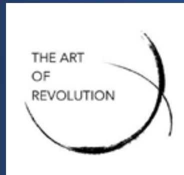
Media and Art