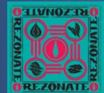
Art and Design